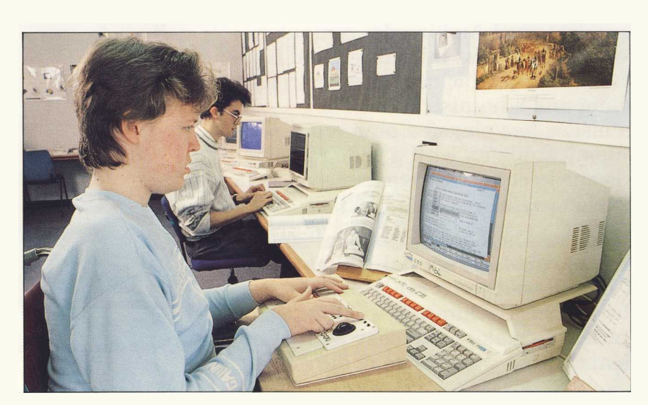
The Lord Mayor Treloar mini keyboard in action

The Archimedes and BBC A3000 computers now form the nucleus of an effective teaching system which allows students to follow the National Curriculum according to their abilities. The Lord Mayor Treloar School is particularly satisfied with the range of software available for their Acorn computers. They can find something to suit all levels of ability, and can easily adapt packages to suit individual needs. The development of new packages such as !ASP and !SpkBd (see page 3) which use the power or RISC OS effectively, gives even better access to computer-based teaching for students with severe disabilities.