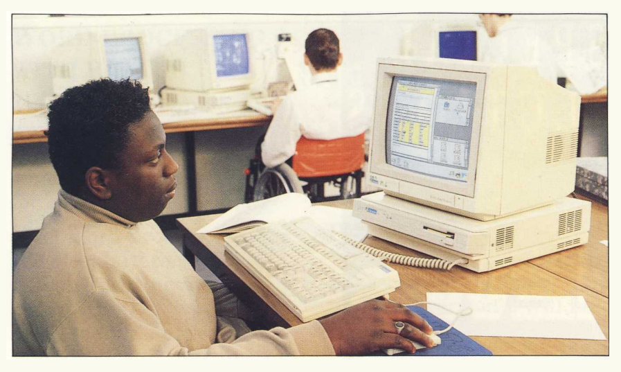
Using Draw to design a document

They soon discovered that the mouse and keyboard could present problems to some of their students, and set about designing modifications. The college has a technical aids department which produces special equipment tailored to the needs of individual students, and the staff of this department have come up with some innovative solutions.