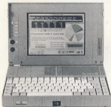
A4 4MB HD System

The Acorn A4 is the latest in notebook technology, with all the features and benefits of a high performance Acorn computer. No longer will you be restricted to one choice of working environment. From home to work, room to room, on or off site, the A4 will give you total flexibility.