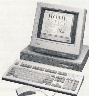
A4000 Home Office System

The A4000 combines the features of the new A3000 series computers with a 3-box design that is based upon the highly successful Acorn A5000. It has a large industry standard hard disc with 80MB of storage, ideal for large amounts of data, text and graphics. For the home user, the A4000, as part of The Home Office pack, offers the complete office at home, including database, word processor and optional inkjet printer.