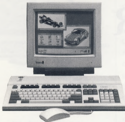
A3010 Learning Curve System

Acorn has introduced a new range of A3000 series computers. The A3010 has been designed for the home user and comes as part of The Family Solution - a family learning and entertainment centre - and also as part of the well-established Learning Curve range. The A3020, with its expandability and range of memory options, has been purpose-designed for our customers within education. As with all products in the Acorn Archimedes range, every new A3000 series computer comes with an extensive application suite including a painting package, a powerful drawing program, a text editor, a music creation, and an editing program.