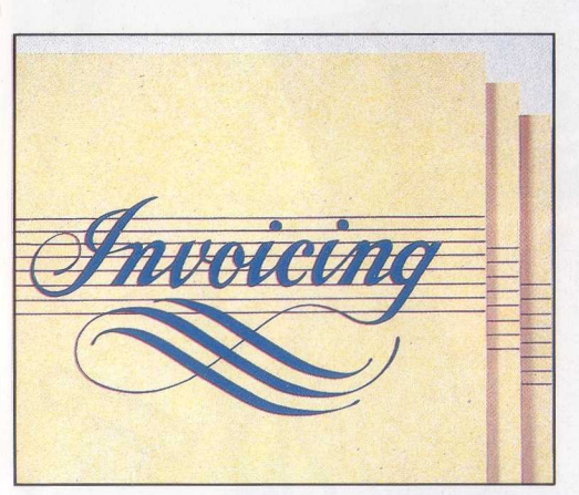
Acornsoft/Mirle programs are designed for use with the BBC Microcomputer and may be purchased singly or as a complete set depending on your needs.